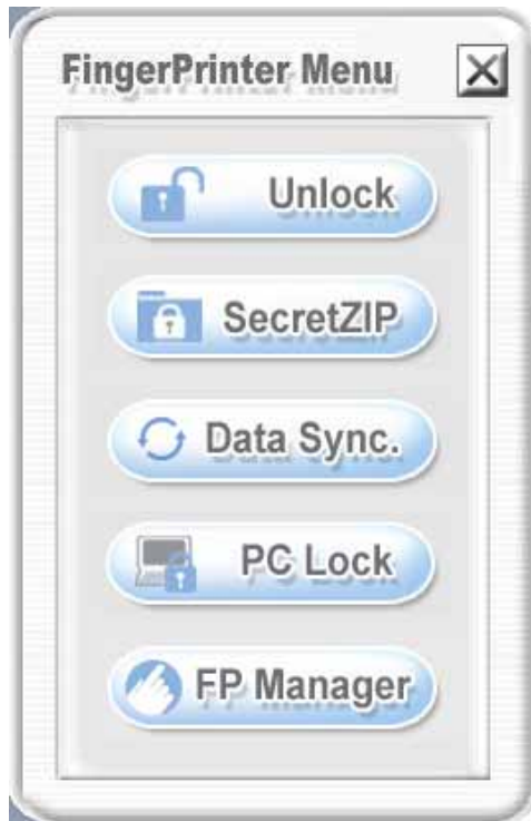
Windows XP Menu